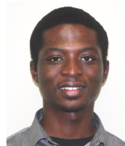
Ebenezer Addae Crisis Response Team